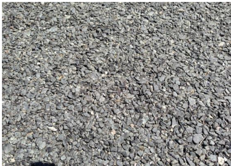
Before Application with Terra Fog™

TERRA FOG™ reinforces the chip seal by reducing asphalt oxidation, preventing brittleness and weakness. If the asphalt in a chip seal becomes brittle due to aging, it will be unable to hold the chips in place, resulting in potentially dangerous aggregate loss. Terra Fog™ penetrates between the aggregates and seals the asphalt surface of the chip seal, forming a protective layer over the asphalt surface, minimizing exposure to air and preventing the aging of asphalt as a result of oxidation.